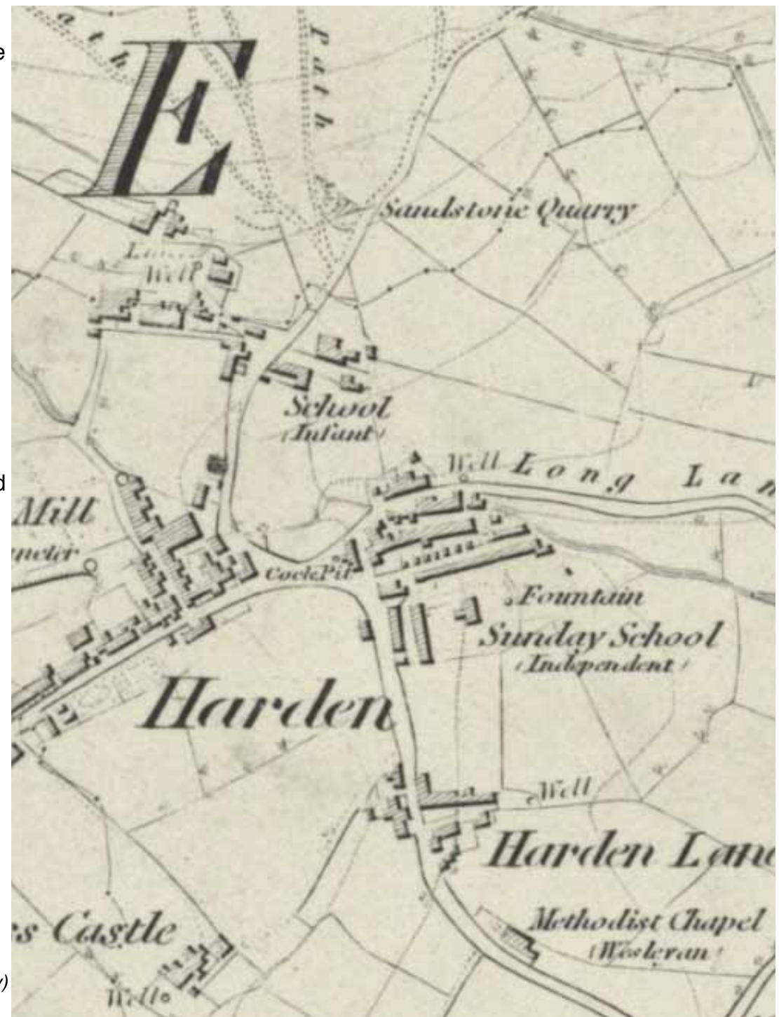
First edition Ordnance Survey Plan of Harden.

As with many places Harden saw its share of suburbanisation and new housing development, but the village still maintains several clusters of historic buildings so typical of a landscape characterised by what was largely dispersed settlement. The early 20th century buildings such as the Police House are also testament to the modernisation of the area as a whole.